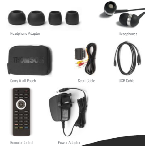
Headphone Adapter Headphones Carry-it-all Pouch Scart Cable USB Cable Remote Control Power Adapter